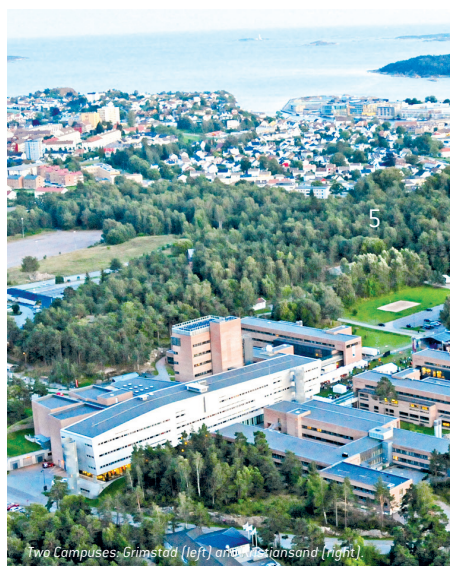
Two Campuses: Grinstad (left) and Håkonsand (right).