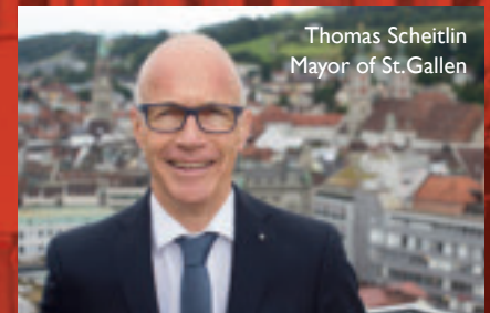
Thomas Scheitlin Mayor of St.Gallen

St.Gallen is very popular among young people and is among the cities with the youngest population in Switzerland. According to the Statistical Yearbook, St.Gallen, with 17.2% of its population in the 20-29-year age bracket, is even the frontrunner in this respect. With approx. 14%, bigger cities like Zurich and Basel are clearly lagging behind.