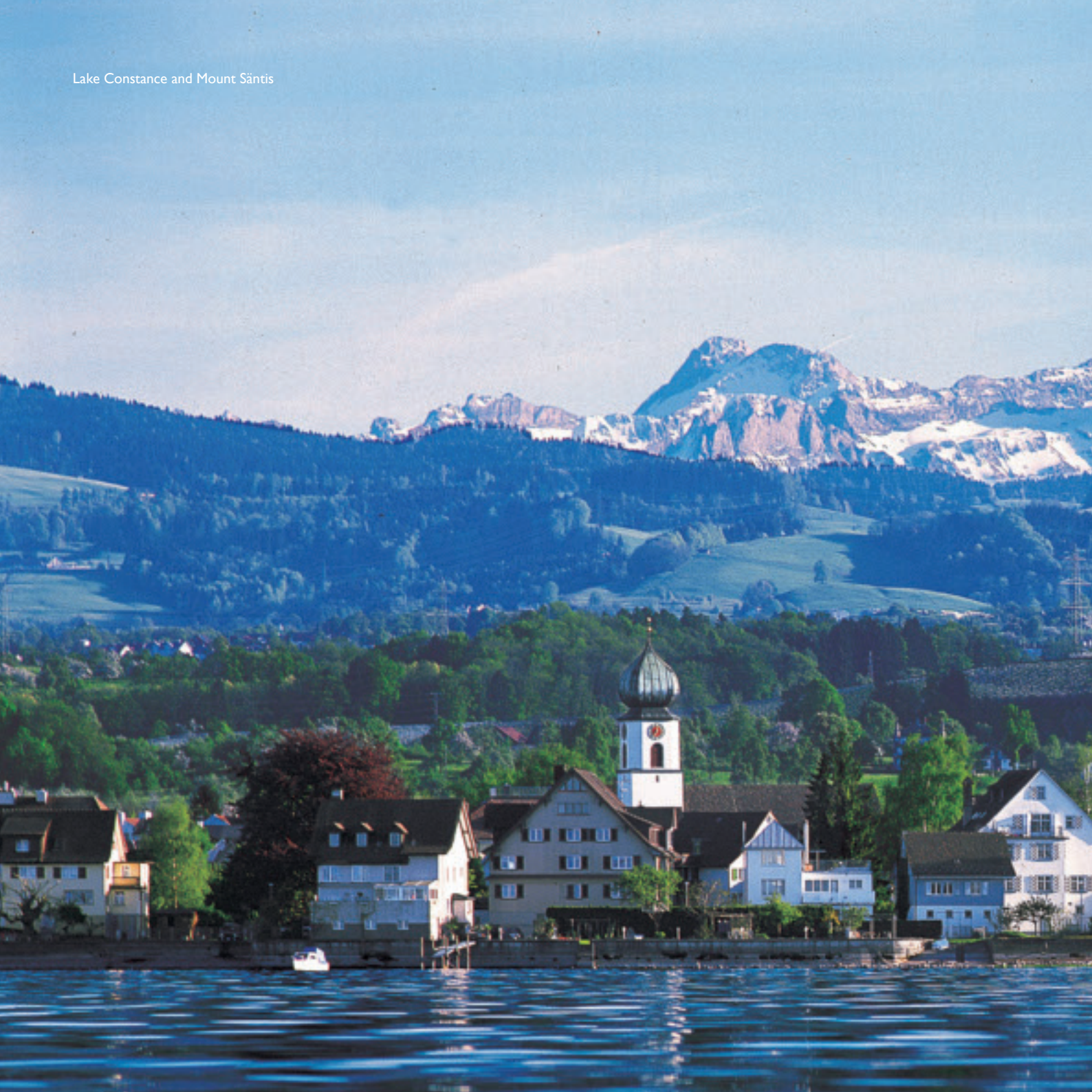
Lake Constance and Mount Säntis