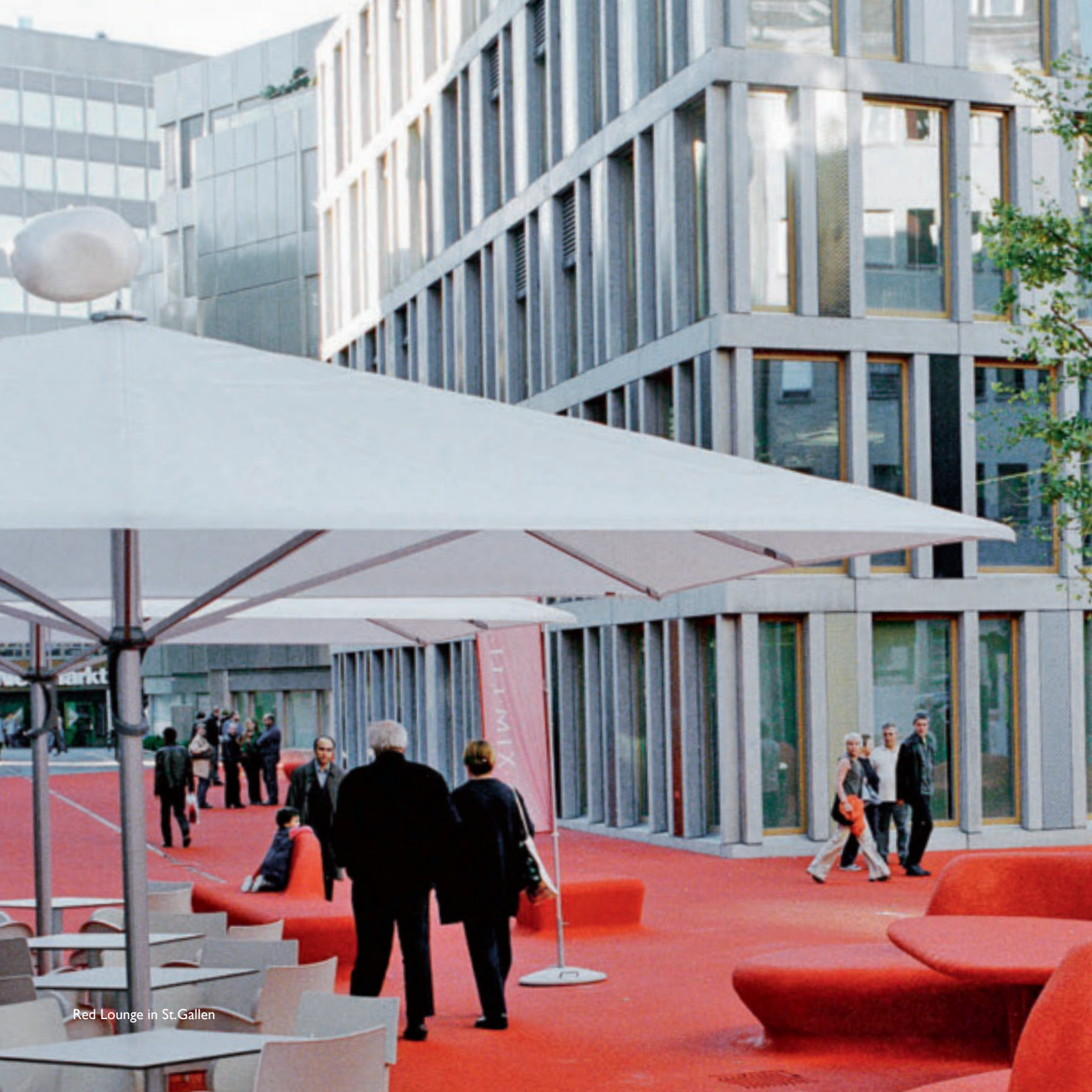
Red Lounge in St. Gallen