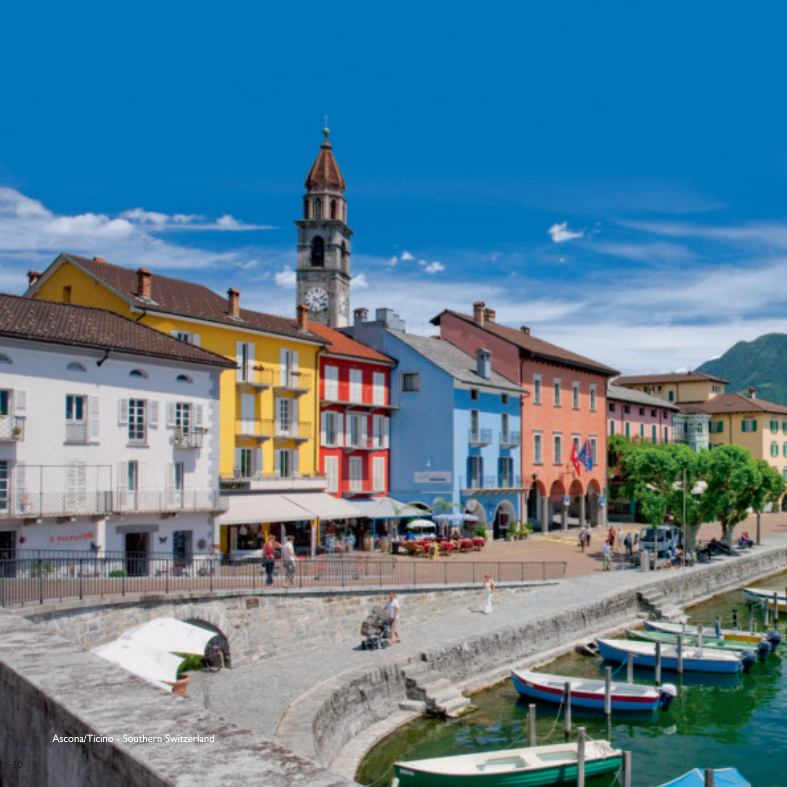
Ascona/Ticino - Southern Switzerland