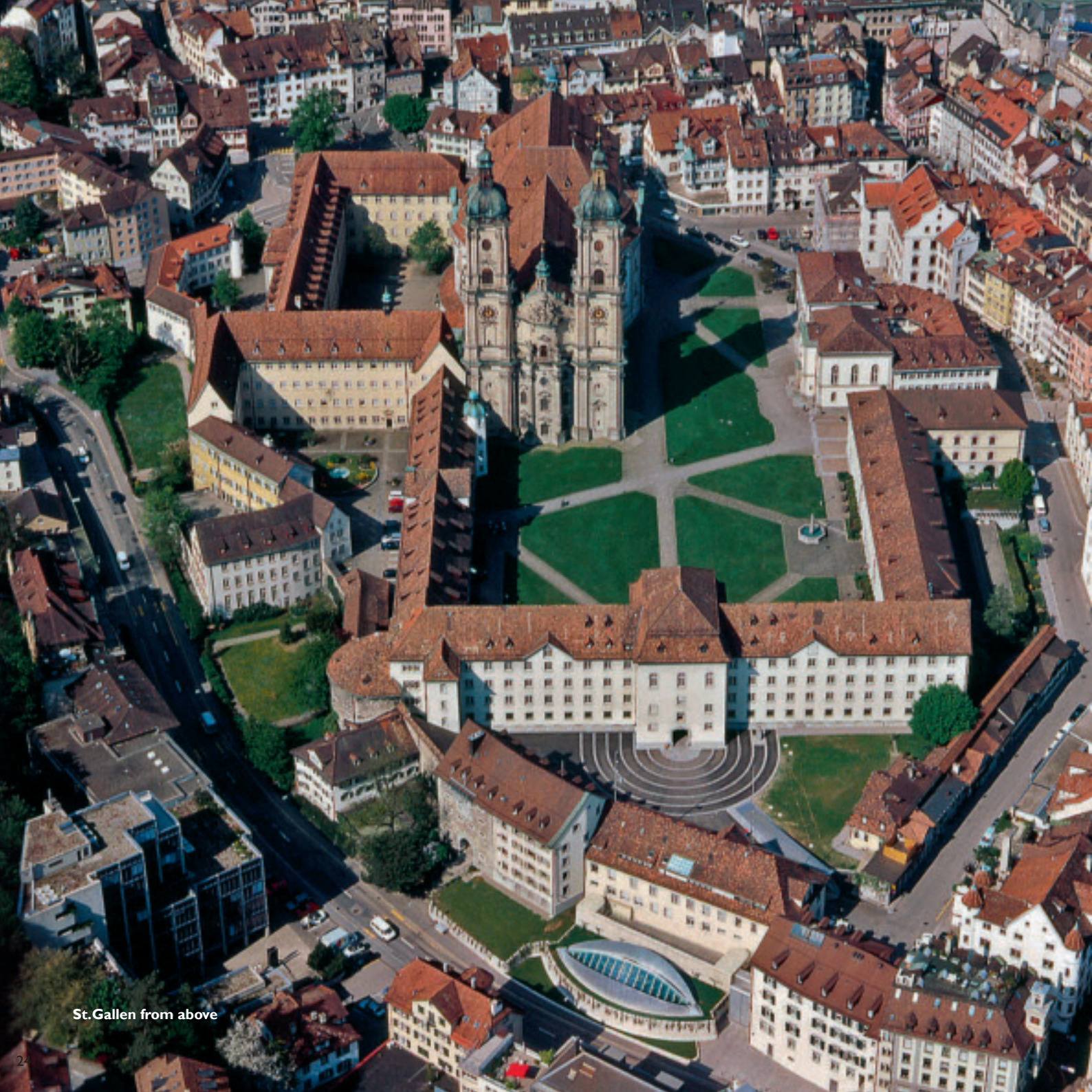
St.Gallen from above