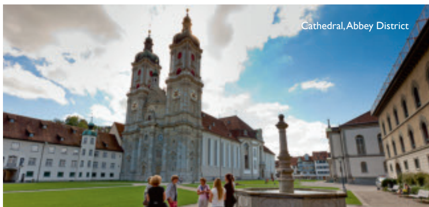
Cathedral, Abbey District

www.stadt.sg.ch/ www.st.gallen-bodensee.ch