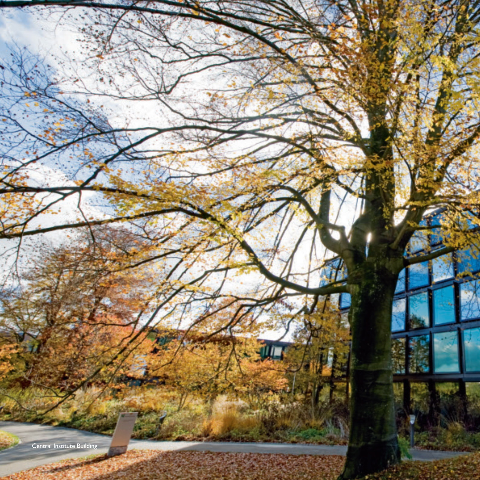
Central Institute Building